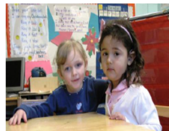
Some of the Children you support by playing in our Charity Golf Tournament !